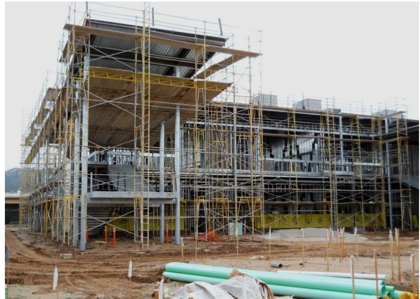
GRANITE HILLS HS