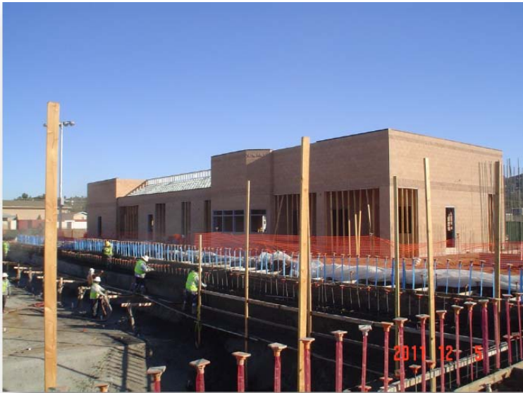
GRANITE HILLS HS