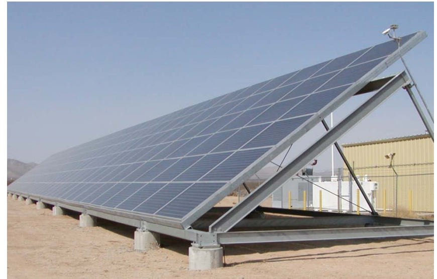
MONTE VISTA HS