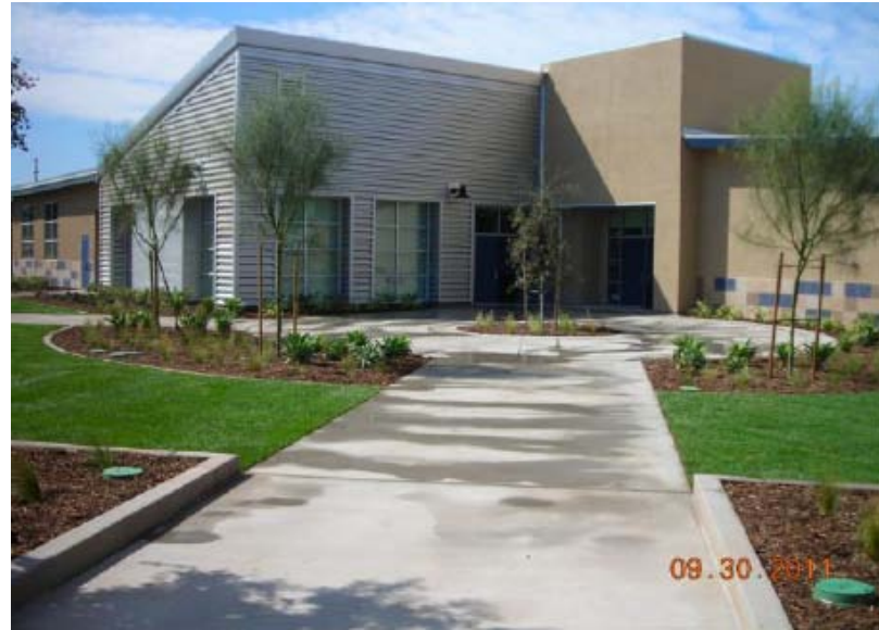
EL CAJON VALLEY HS