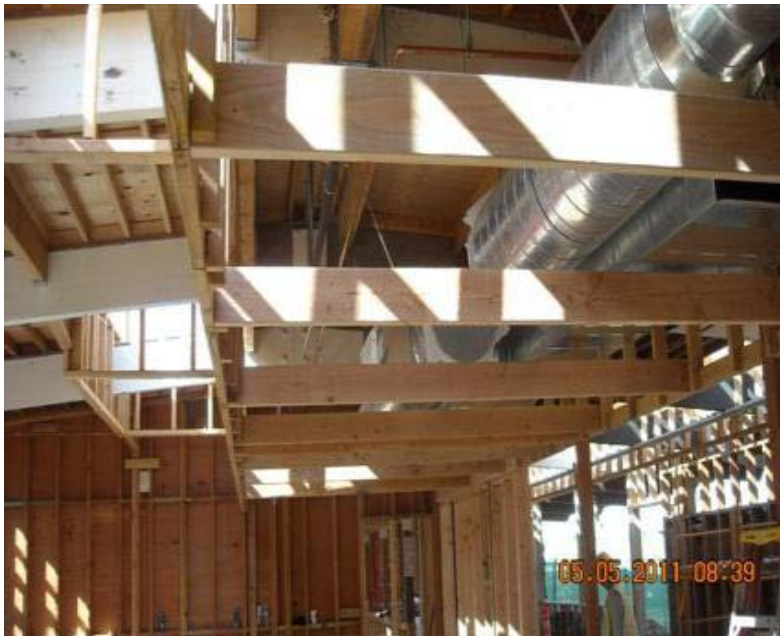
EL CAPITAN HS