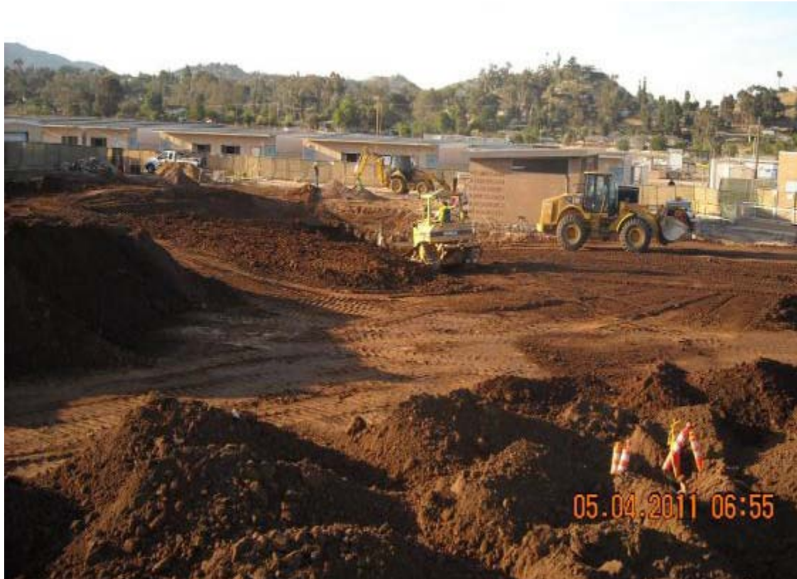
GRANITE HILLS HS BUILDING 200 SITE PREP