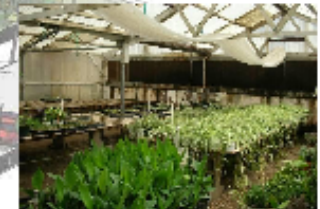
NEW PROPAGATION GREENHOUSE