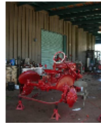
FARM SHOP RENOVATION