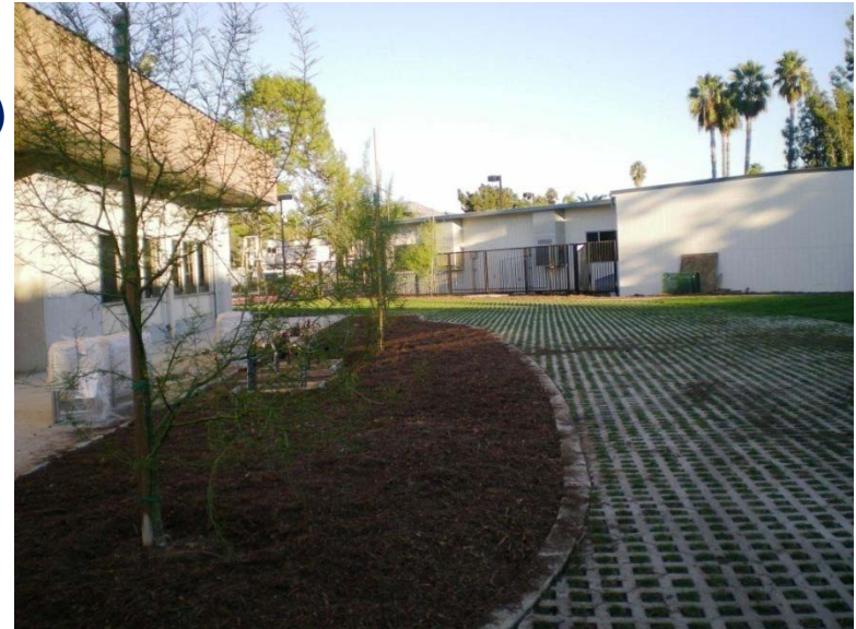
REACH Academy at WTC