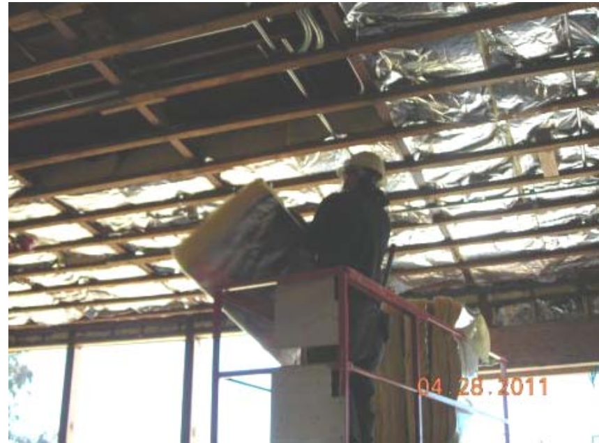
EL CAJON VALLEY HS