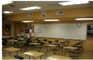
NEW CLASSROOM AND COMPUTER LAB