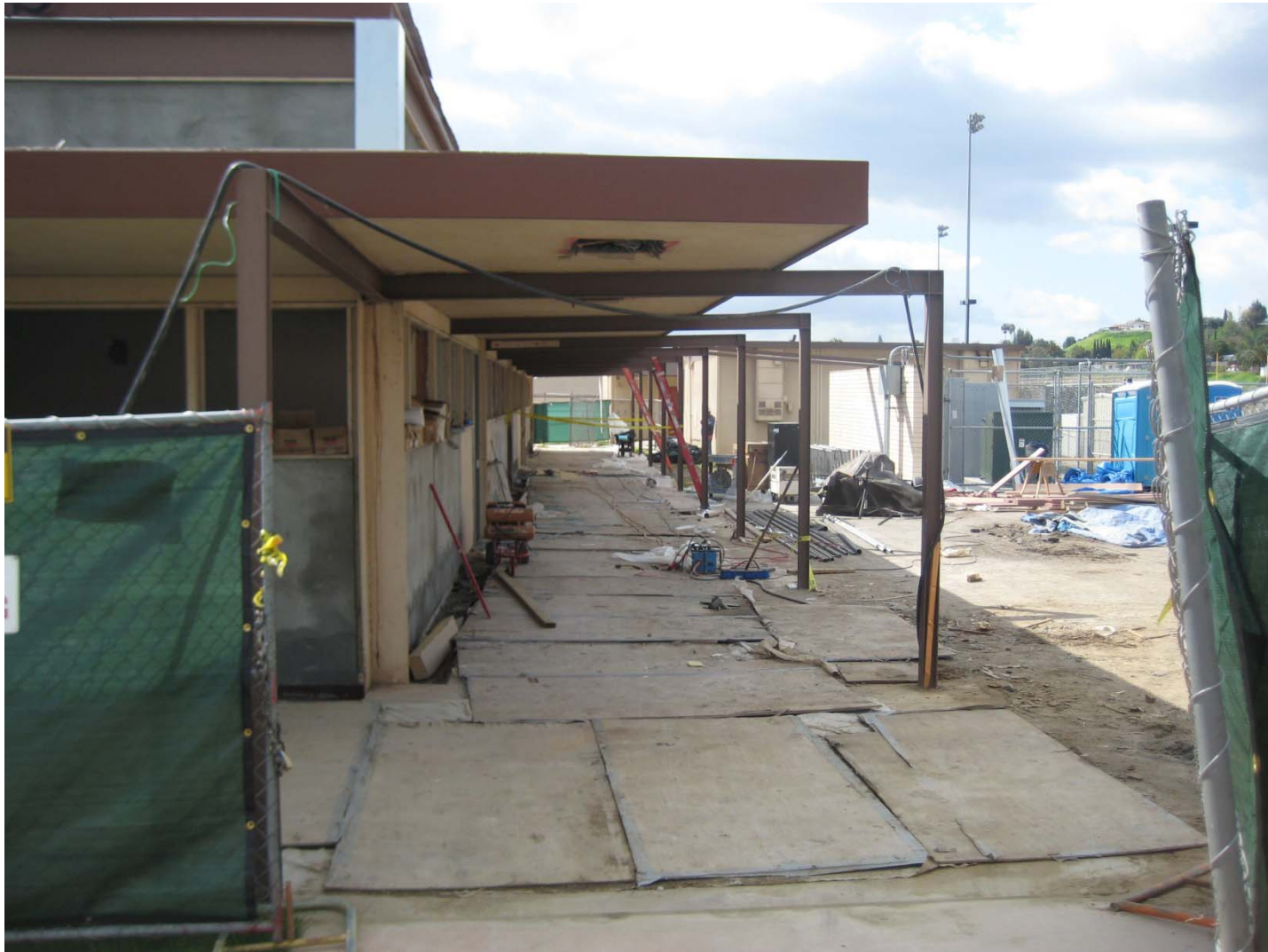
MOUNT MIGUEL HIGH SCHOOL – BLDG 900 – II CLASSROOMS 10