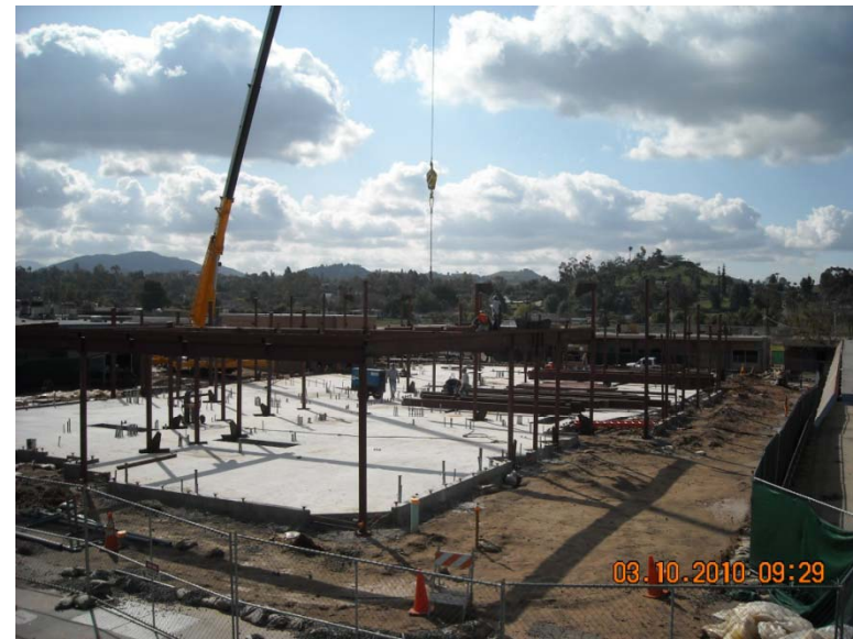
Granite HS Science

MONTHLY REPORT TO THE BOARD Facilities Management March 11, 2010