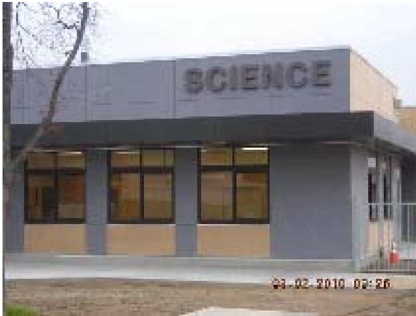
Santana HS Science