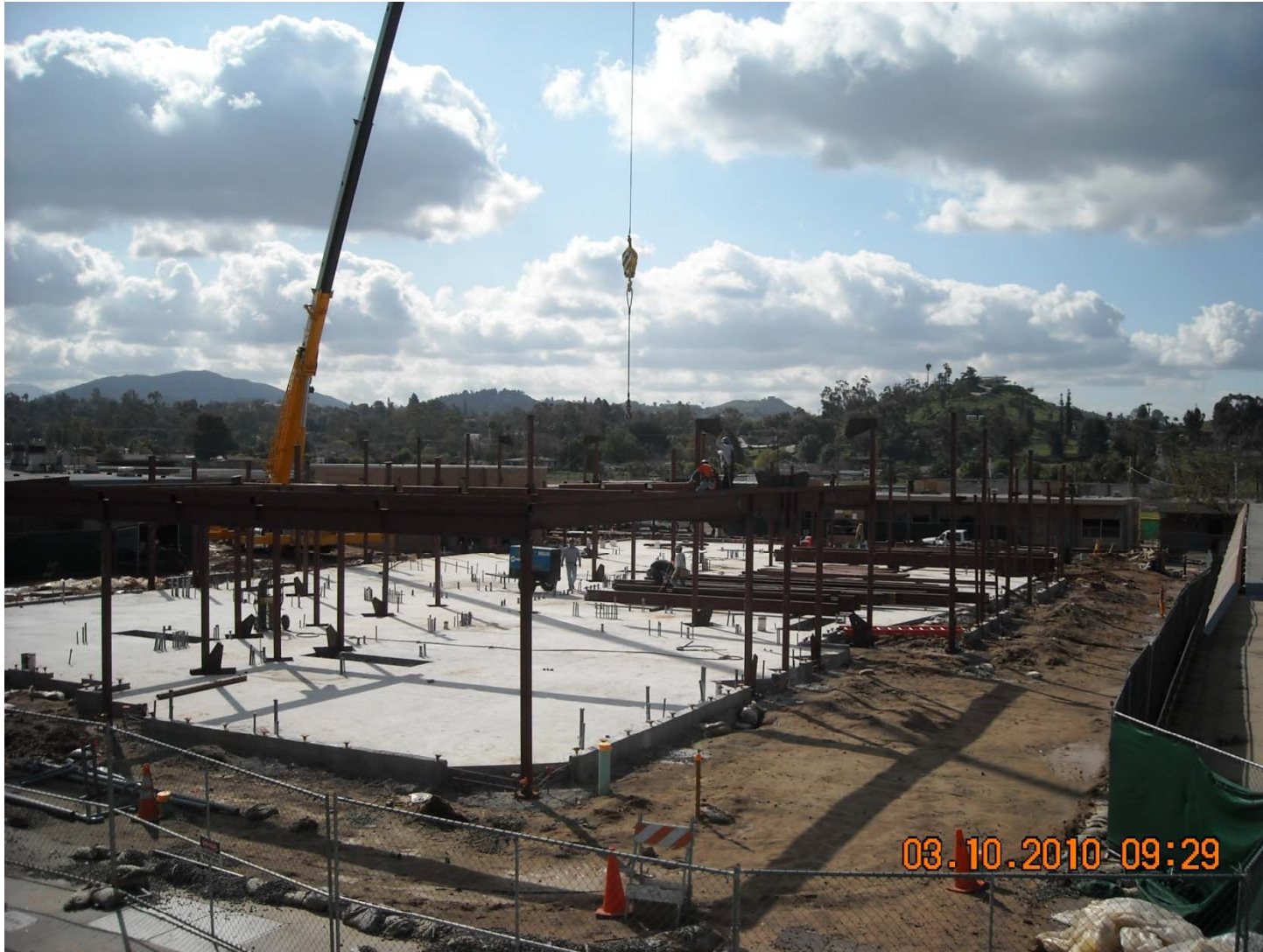
GRANITE HILLS HIGH SCHOOL – SCIENCE