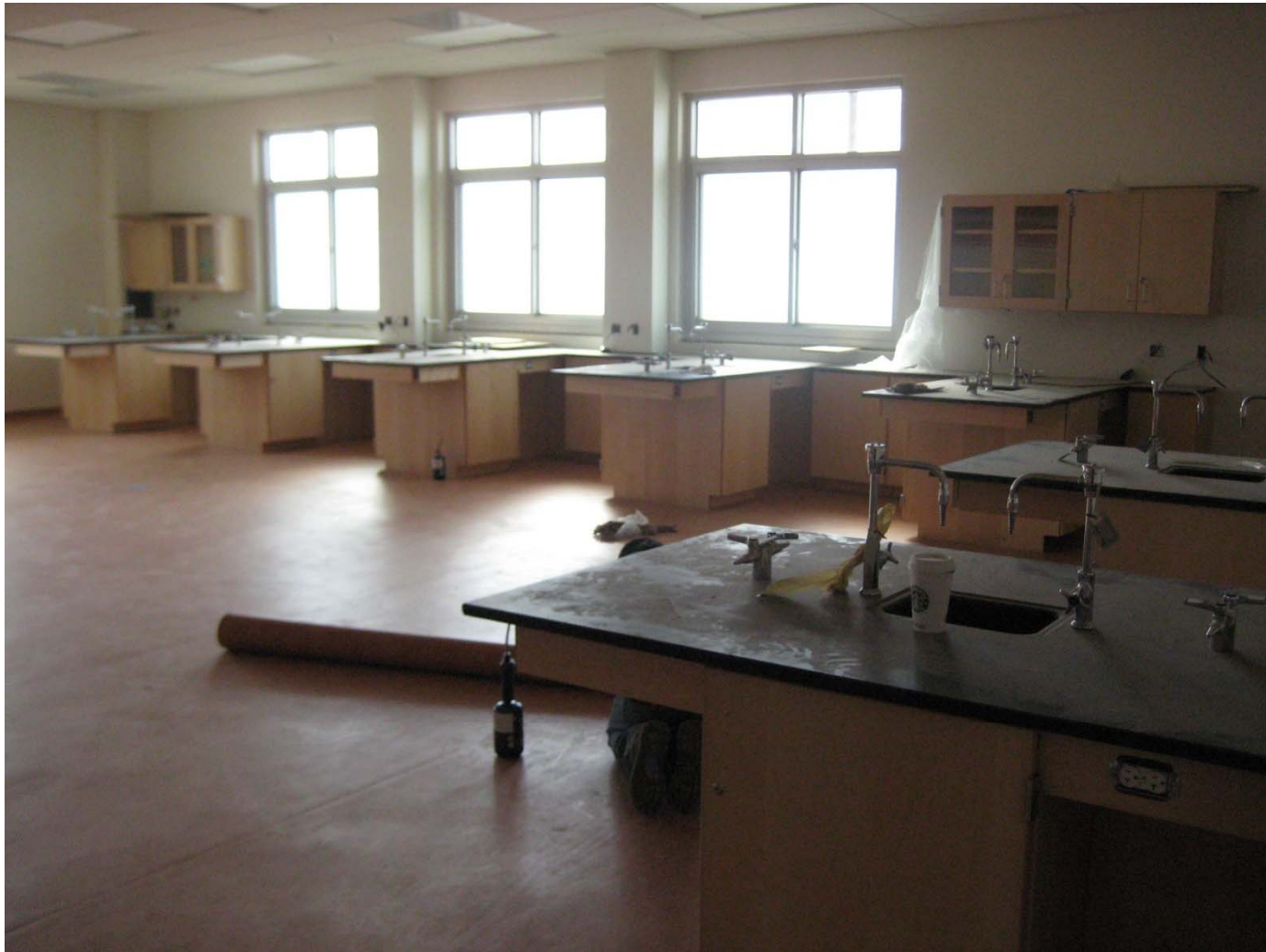
VALHALLA HIGH SCHOOL - SCIENCE