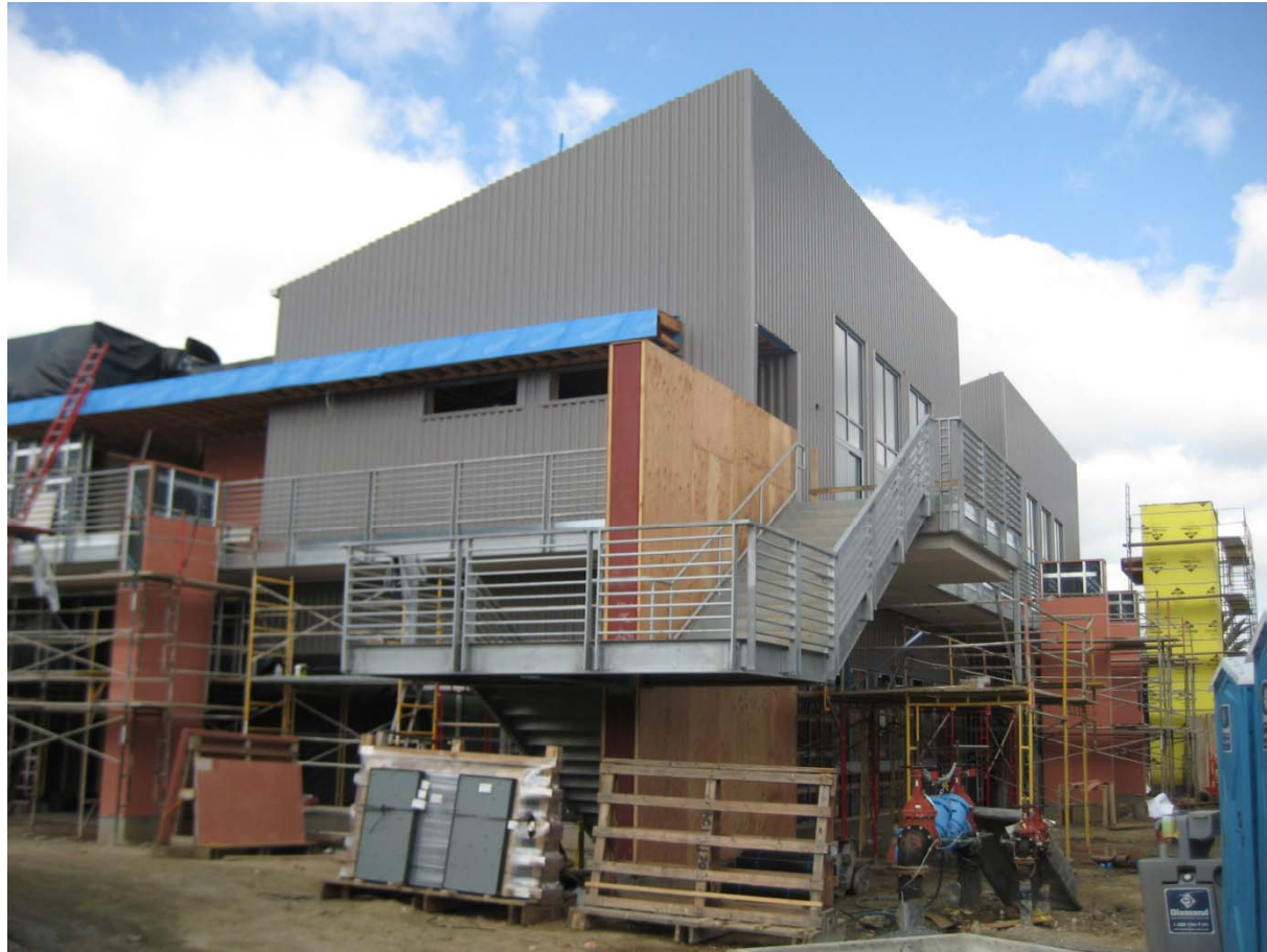
GROSSMONT HIGH SCHOOL – SCIENCE