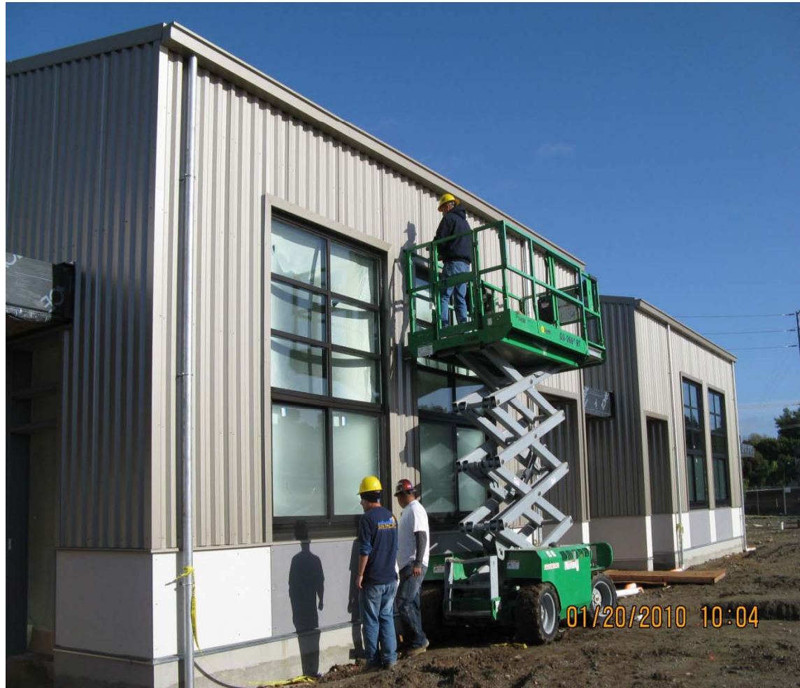
MONTE VISTA HIGH SCHOOL - SCIENCE