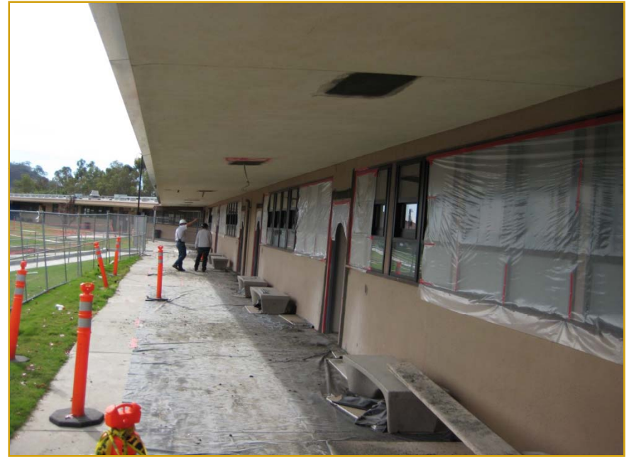
Monte Vista High School