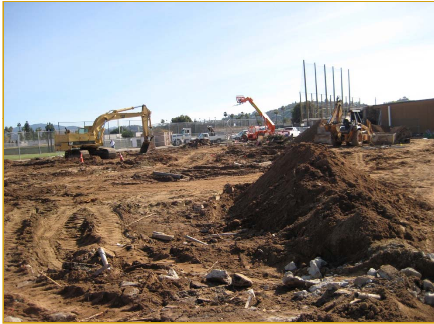
El Cajon Valley High School