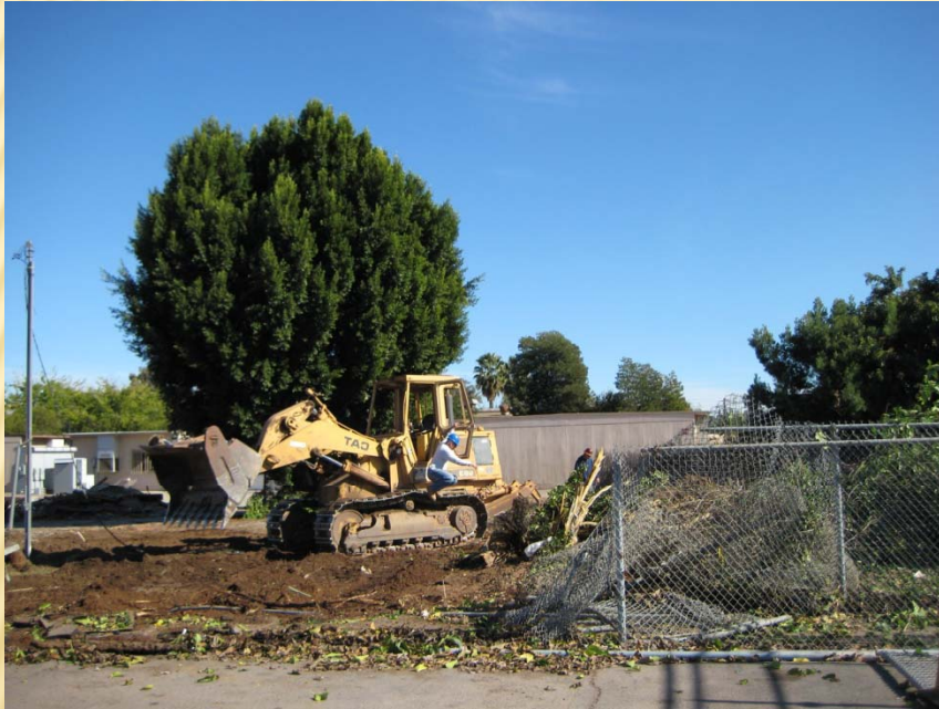
El Cajon Valley High School