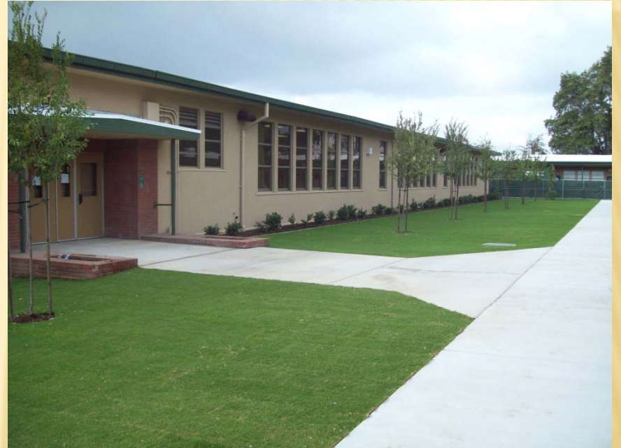
Helix Charter High School