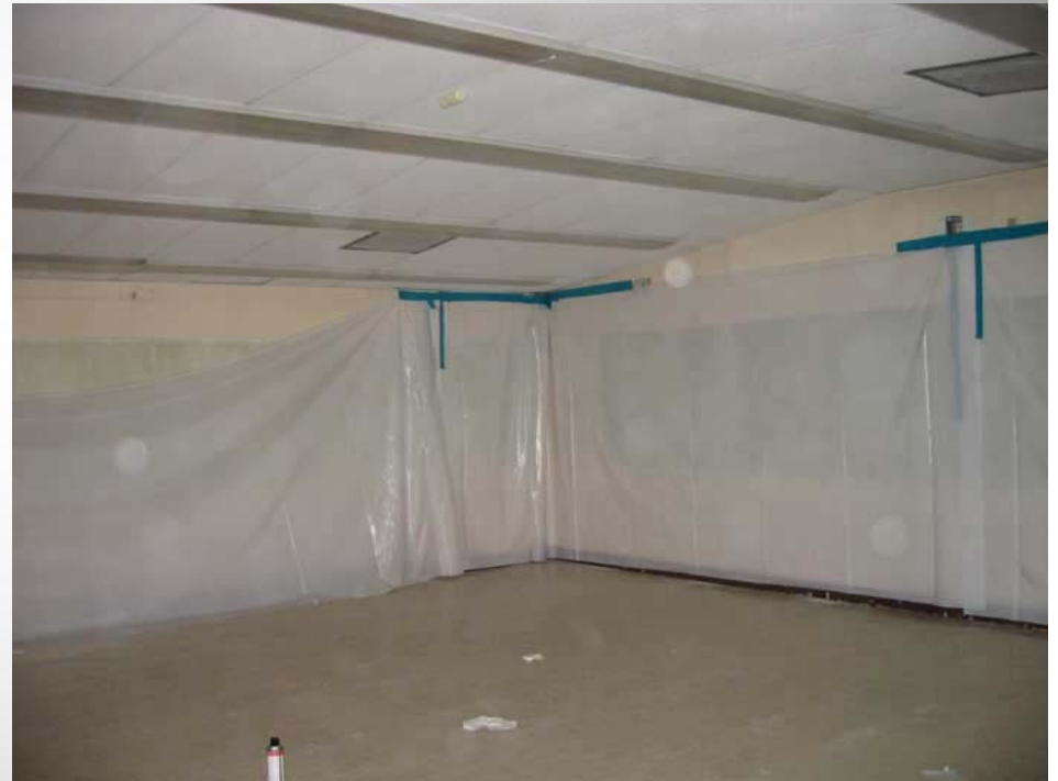
Grossmont High School Building 700