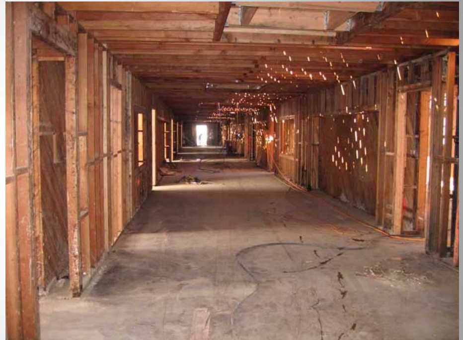
Helix Charter Building 10