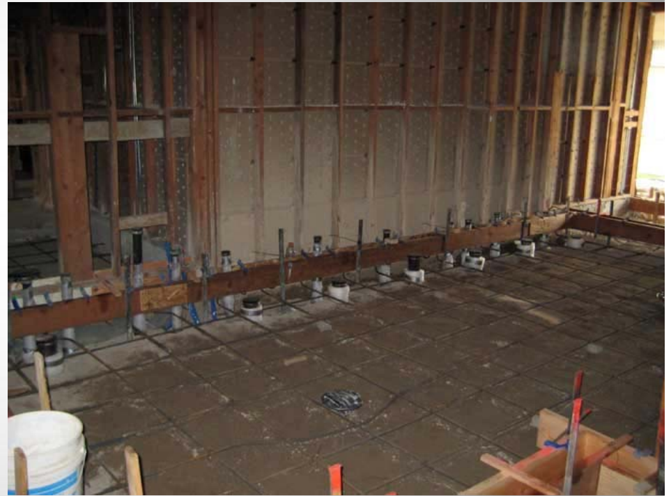
Monte Vista High School Buildings 100