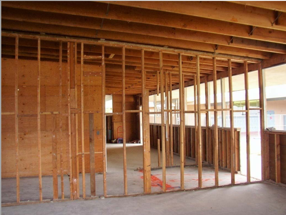
Granite Hills Building 50