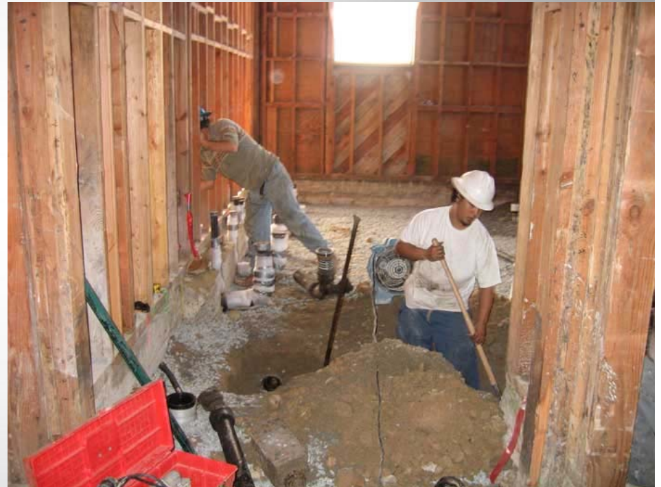
Helix Charter High School Building 10