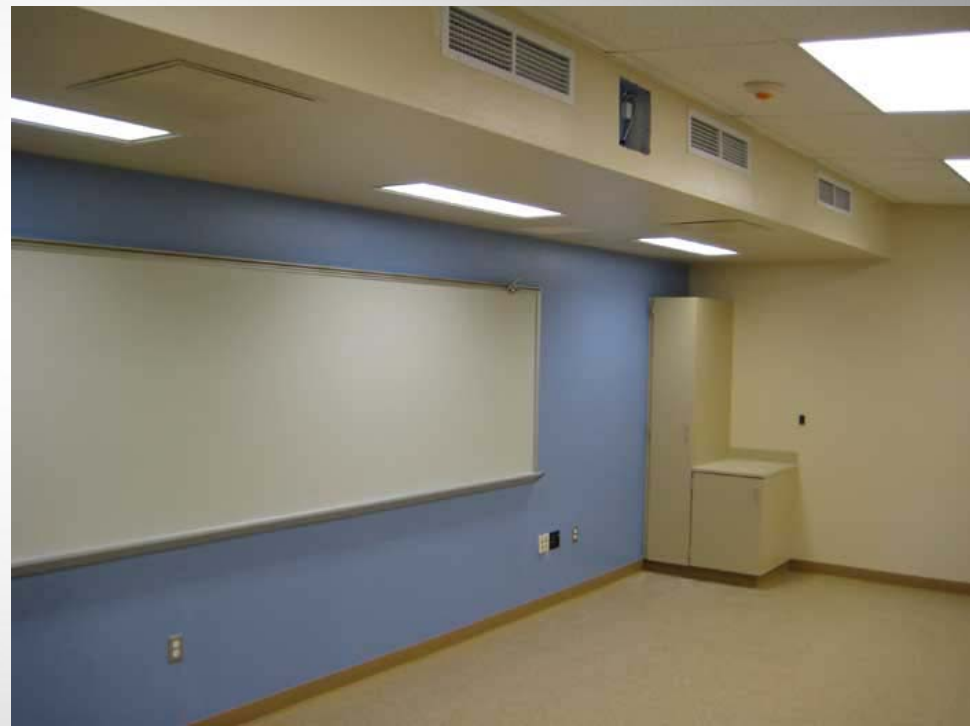
El Cajon Valley High School Building 500