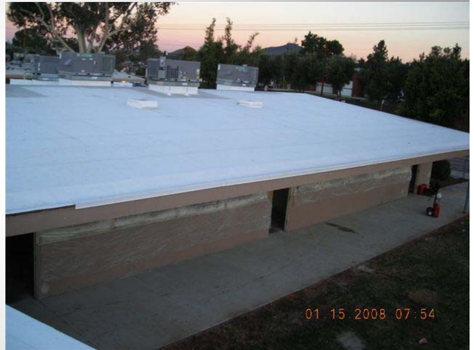
Granite Hills High School Building 50