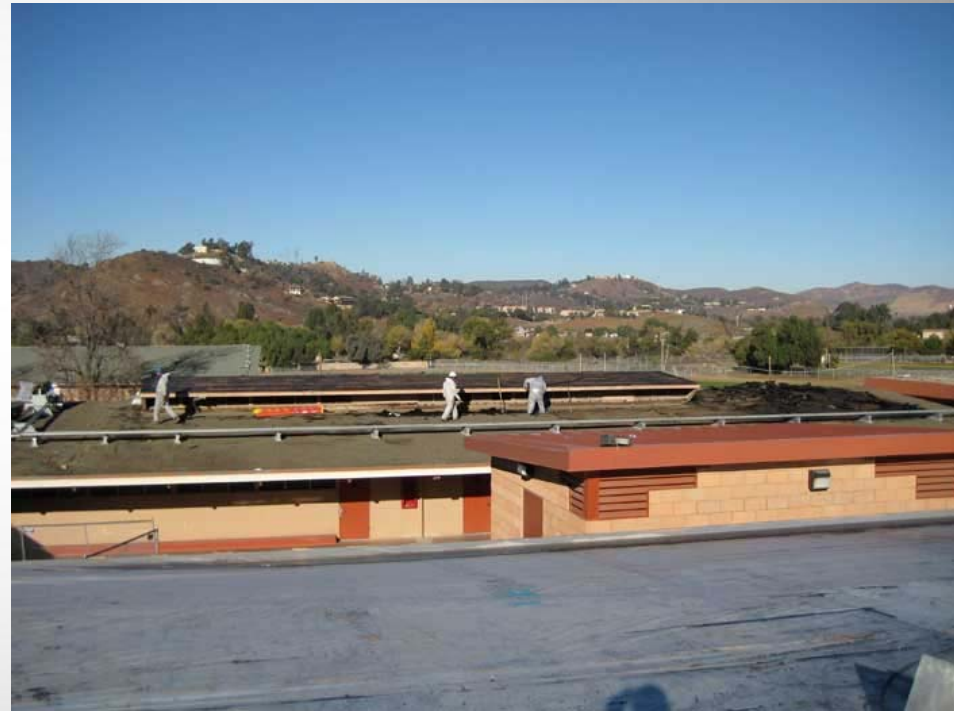
El Capitan High School Buildings 600 and 700