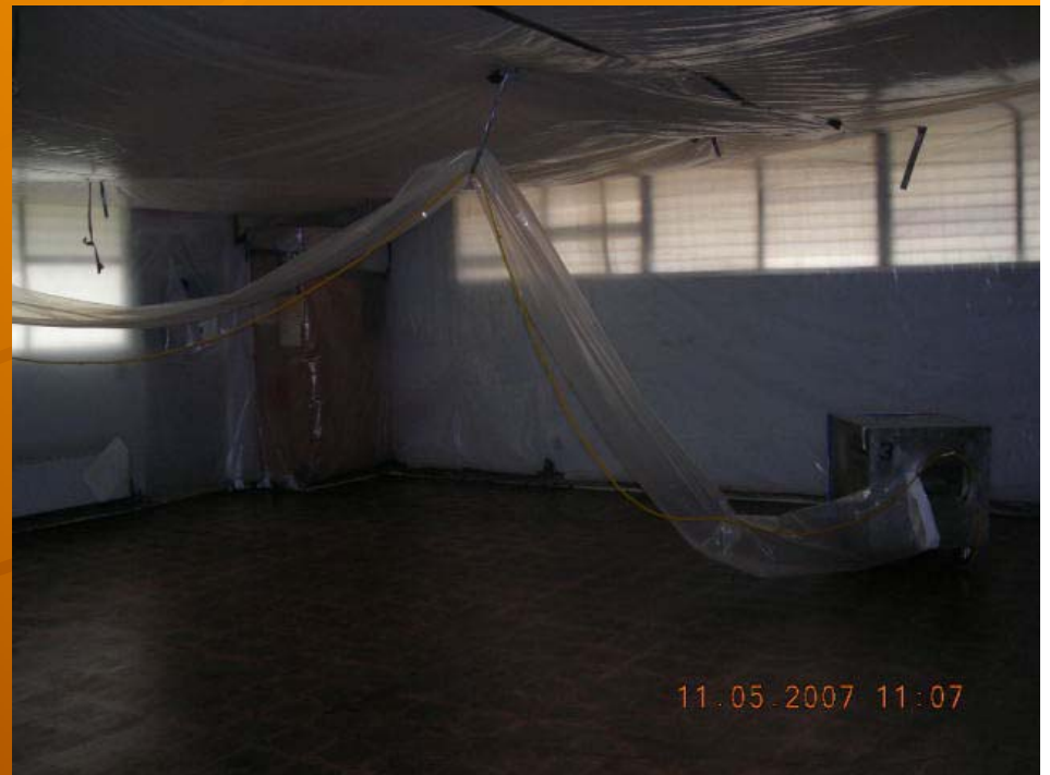
Granite Hills – Bldg. 50