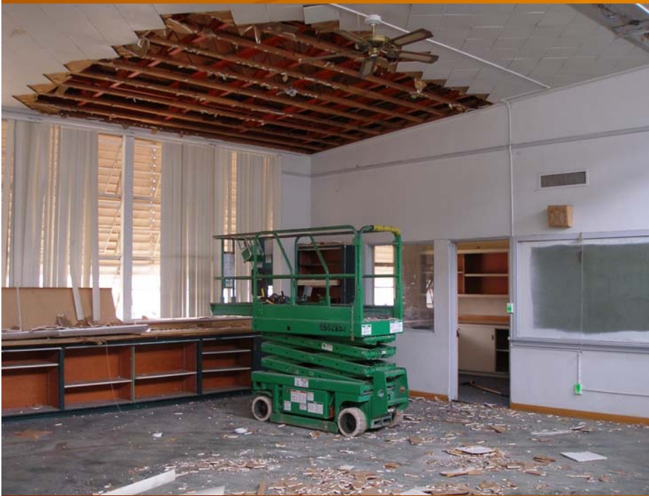
Helix Charter HS – Bldg. 10