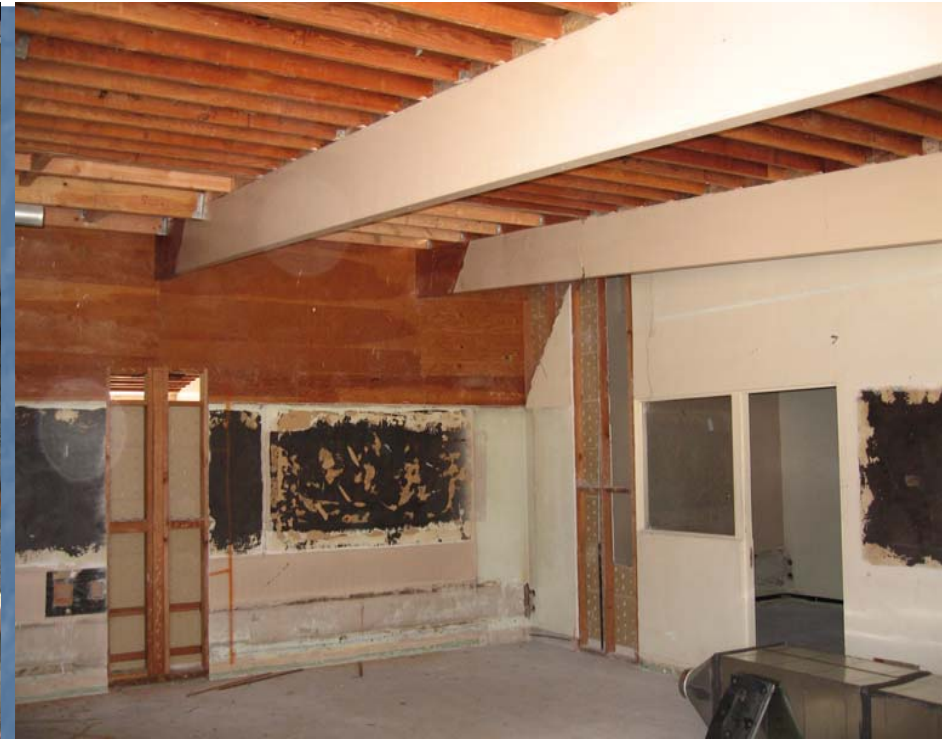
El Cajon Valley High School 500 Bldg - Phase 2B