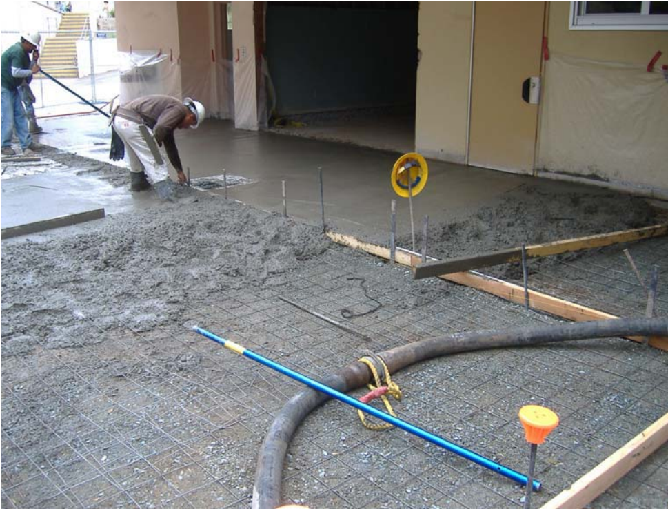
Grossmont High School 800 Bldg - Phase 2B