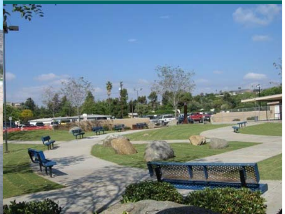
Granite Hills High School Quad