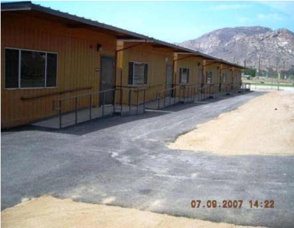
El Capitan High School Interim Housing