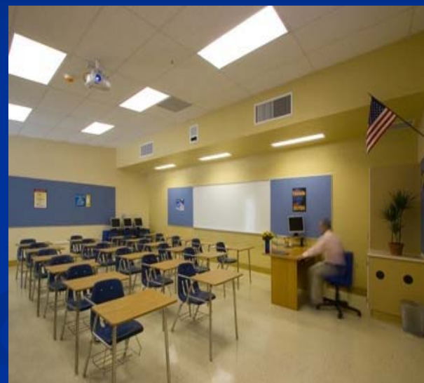
Model Classroom (After)