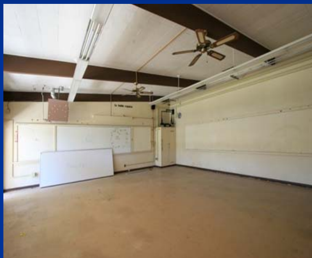
Model Classroom (Before)