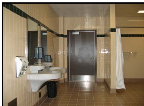
Work Training Center ADA Compliant Bathroom

The hard work and training that takes place at the Work Training Center is now a little easier at the newly renovated and ADA compliant campus. Staff and student bathrooms were upgraded to accommodate individuals with special needs. An automated front entry door allows for easier access to the one-of-a-kind facility in the Grossmont Union High School District. Watch the District find solutions that work for all members of the Grossmont family!