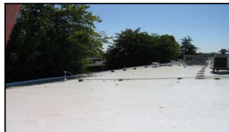
Mount Miguel Classroom Roof