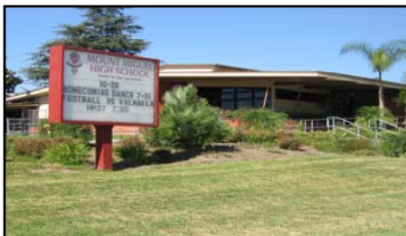
Mount Miguel High School

Several Mount Miguel High School roofs are currently being replaced with the innovative and energy saving technology of Saranfil™ materials. Meeting Title 24 requirements, the re-roofing projects are slated for completion by mid-December. On deck for MMHS are surveillance cameras and gym bleachers. Matador Pride is everywhere!