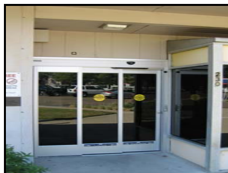
Work Training Center Automated Front Entry Door