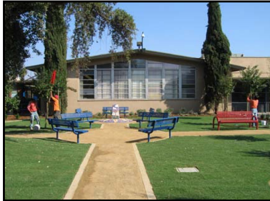
El Cajon Valley High Restored Lawn Area Student Mosaic Drinking Fountain Art Project Class of 1956 (Red) Bench

Staff and students are delighted with the beautiful landscape restoration. Elsewhere on campus, mature oak trees and a new flag pole were added to complete the "pride of ownership" feeling at the Home of the Braves.