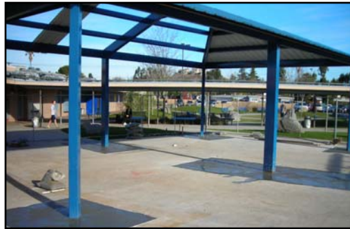
Granite Hills Lunch Shelter Nearing Completion

El Cajon Valley and Granite Hills students will soon have shelter under which to take a break and eat. A lack of covered areas at these valley schools as well as the infamous East County heat adds up to rising temperatures. Both sites needed respite areas for their student populations to relax in the shade and that's exactly what they got. The lunch shelters will be completed by the end of January 2007. Good news that's just in time for the rainy season.