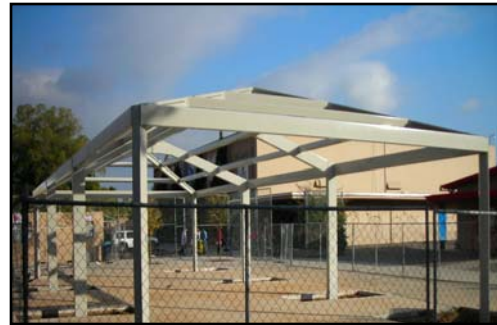
El Cajon Valley Lunch Shelter Construction In Progress

The Chaparral High School lunch shelter is complete and already in use by students at this Fletcher Hills campus. The beautiful and functional structure allows students to take shelter from the elements and enjoy their surroundings. New trees and benches add to the pleasant atmosphere on campus pictured in the photos below.