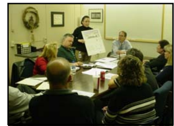
El Capitan Design Task Force