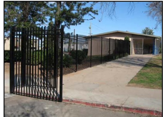
El Cajon Valley's Security Fencing