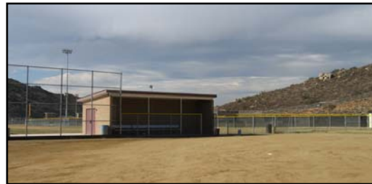
Steele Canyon High School Field Dugout