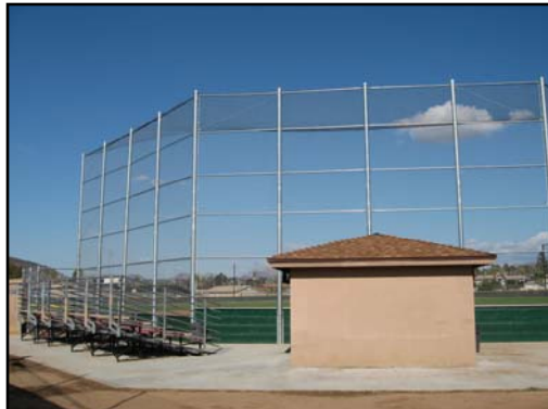
El Cajon Valley's Baseball Field

Elsewhere around campus, the baseball field and fencing have been renovated and replaced. Replacement fencing was installed as part of the comprehensive safety and security efforts district-wide utilizing non-Prop H funds. The baseball diamond pictured below garnered a new backstop and sod along with a net that will be installed as soon as the soil is solid enough after recent rains to accommodate heavy-duty trucks on site. Modernization is moving along.