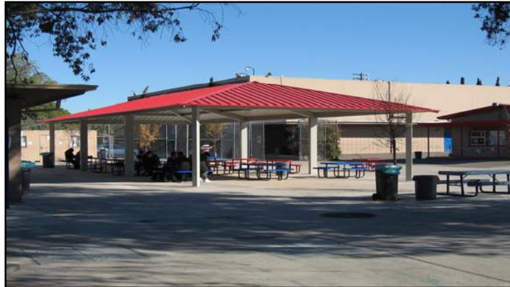
El Cajon Valley High School New Lunch Shelter

El Cajon Valley High School Braves are now enjoying their lunch and breaks under the newly constructed shade structure adjacent to the quad area on campus. The beautiful, red-roofed pavilion stands out as a welcome respite from the often unrelenting sun. Students frequently crowd the coveted space and can be seen studying after school as well. Durable, yet attractive, the structure will last many, many years - long after current students see their children graduate from the home of the Braves!