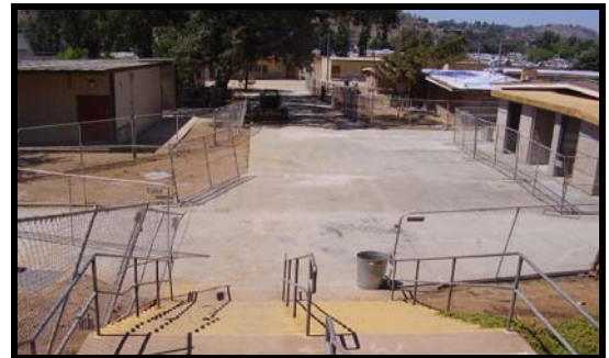
El Capitan High August 2006