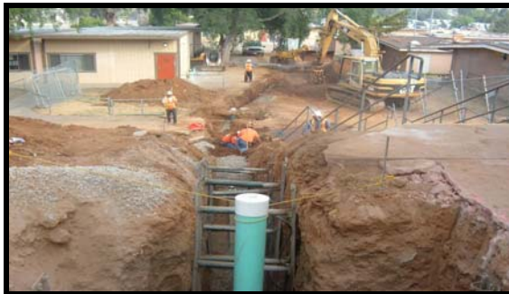
El Capitan High July 2006

In June work began in earnest the day after graduation on infrastructure improvements at El Capitan High School. New storm drains as well as water, gas, and electrical lines were added, paving the way for the next phase of modernization to begin in the Spring of 2007. These "wet" utilities are the foundation upon which all physical renovation is built. This work is slated for completion by early October, and we are able to report that this project is ahead of schedule. Masonry for new stand-alone buildings and ADA-compliant ramps will also be finished soon.