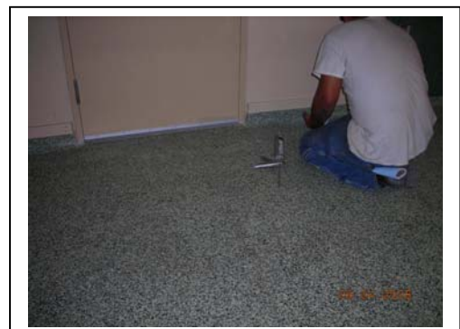
Install of baseboard in 200 corridor.